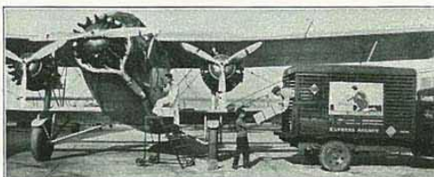
United Air Lines Planes carry air mail and express.