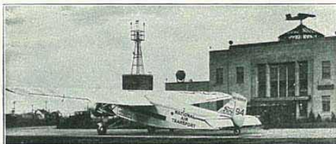
A coast to coast chain of modern, comfortable depots adds to the pleasure of traveling by air.

TRAVELERS' INSURANCE —At request of passenger, company representatives will issue, as agents of the Travelers Insurance Co., a $5,000 policy which is in force during the flight up to 24 hours for $2.00. (Schedules and fares effective June 15, 1931—subject to change without notice).