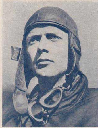
COLONEL CHARLES A. LINDBERGH Chairman, Technical Committee

The service is surrounded by the most advanced devices to assure reliability and regularity of operation. Pilots of the line are the most experienced men avail-