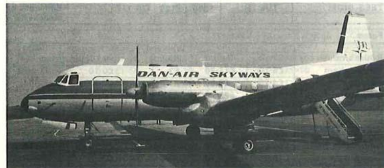
The Hawker Siddeley 748 has been specially designed for short-range flights. It has an out-standing record of reliability and is powered by two Rolls-Royce Dart engines. This modern aircraft is fully pressurised for passenger comfort and has a seating capacity of 48.