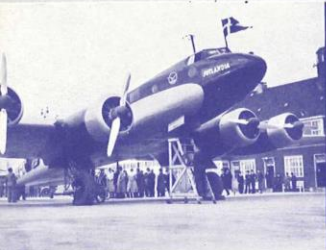
The airport at Copenhagen is within twenty minutes' bus ride of the centre of the City.