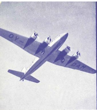
One of the D.D.L. fleet of 4-engined Condors operated by a crew of four.