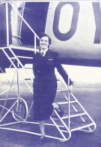
Our stewardesses have to be excellent linguists. This one speaks seven languages perfectly