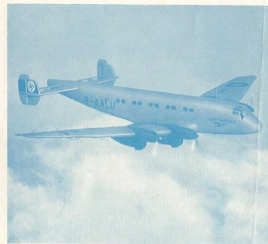
40-passenger four-engined Express Air Liner Junkers Ju 90