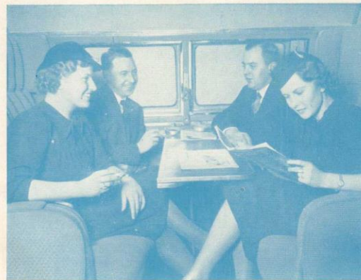
Passenger compartment Ju 90 (40 passengers)