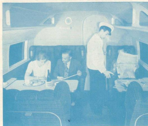
Passenger compartment FW 200 (24 passengers)