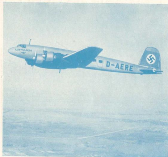
24-passenger four-engined Express Air Liner Focke-Wulf FW 200

General Agents in Great Britain, Imperial Airways Ltd. Book your seat through: