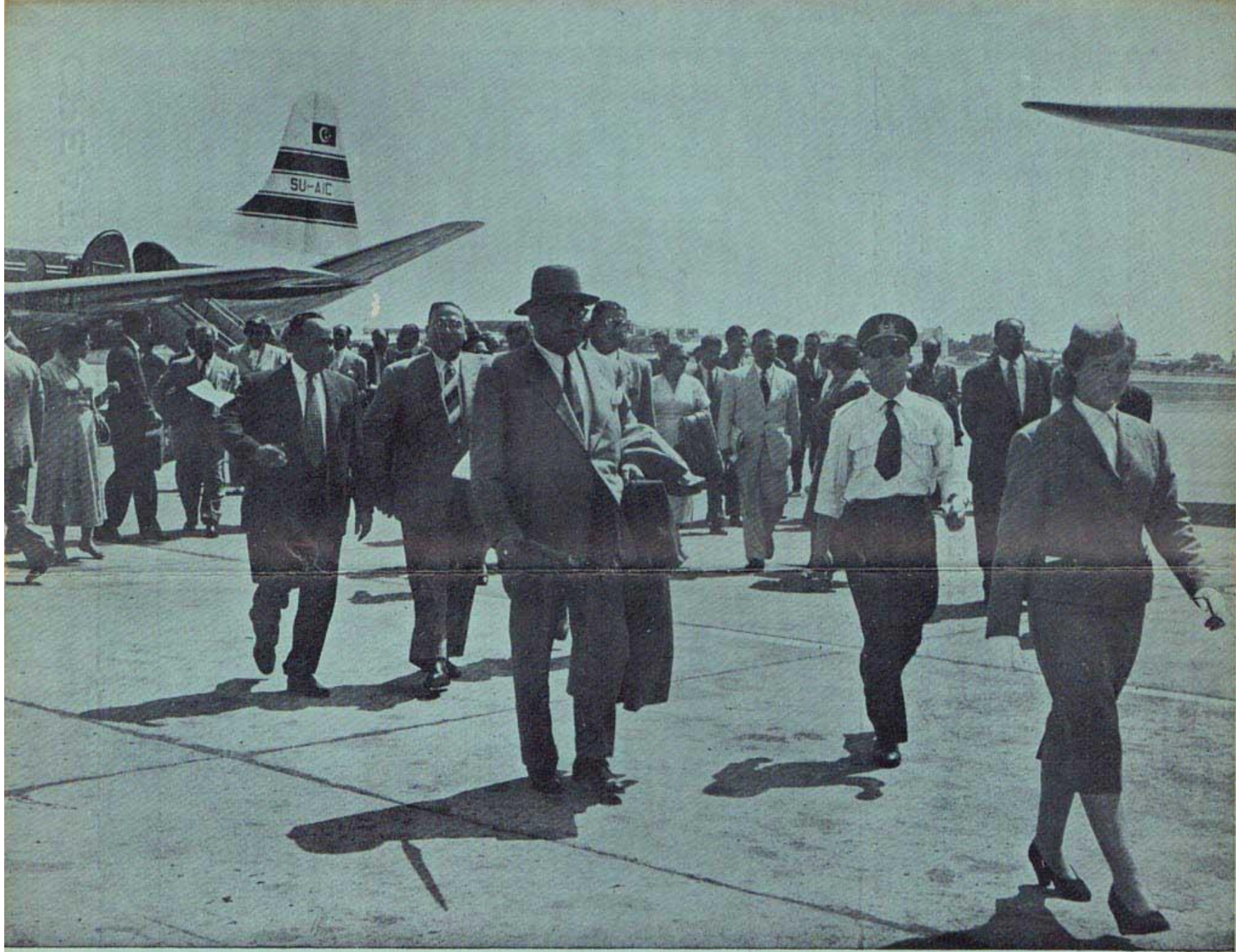
MISRAIR'S EFFICIENT GROUND STAFF WILL TAKE CARE OF YOU FROM THE MINUTE YOU DISEMBARK